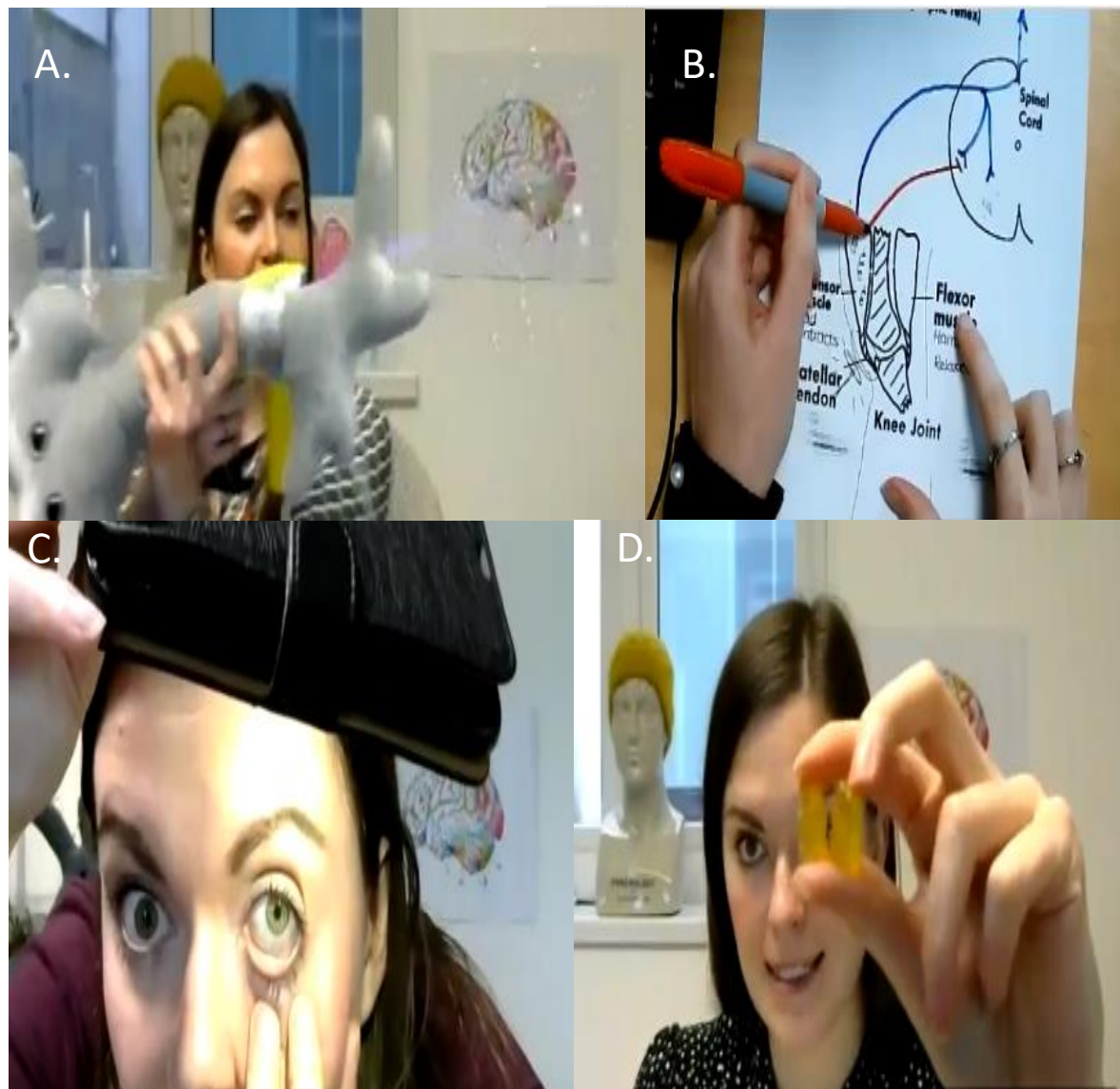
Figure 1 - Creative and engaging approaches to online teaching.

Lecturing large cohorts of 500 students, I introduced live demonstrations, props, interactive polling, music, and videos into my lectures. During the COVID-19 pandemic, I trialled new methods to engage students online (Figure 1A-D). I have also incorporated other innovative demonstrations including vision changing goggles, interactive spot the difference challenges and at home experiments.