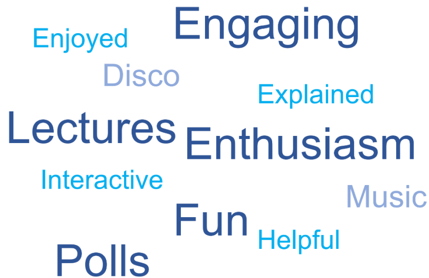
Figure 3 – Word cloud generated from free text student comments on Year 1 undergraduate lectures.

The word cloud is based on 231 responses anonymously collected from students across two Year 1 modules within the School of Biosciences. Word sizes reflect the regularity of words within free text comments.